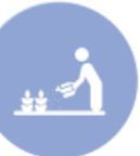
Food and farming