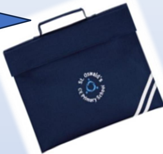
St Oswald's Book Bag £6.99