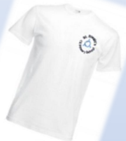
St Oswald's T-Shirt £6.99