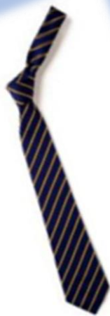
St Oswald's Tie £5.49