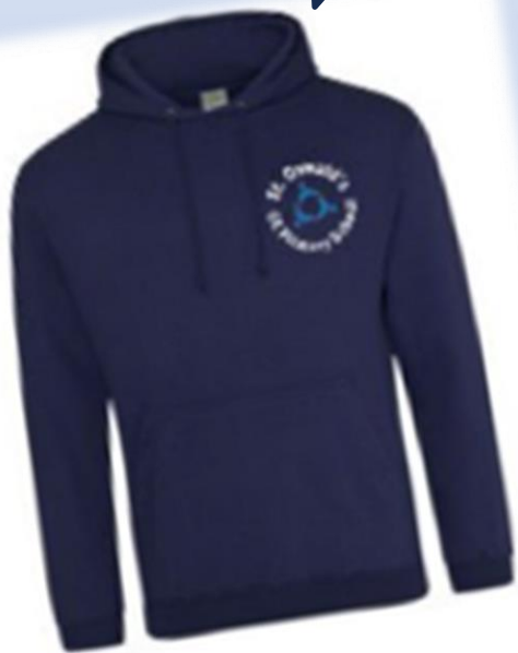
St Oswald's Hoodie £15.99