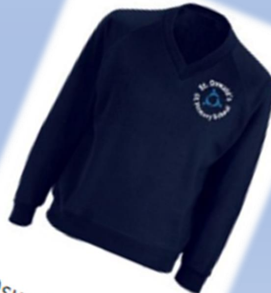
St Oswald's Crew Neck Jumper £12.99