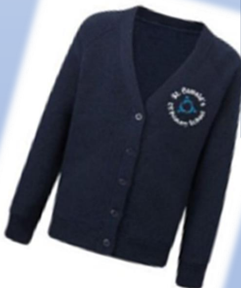
St Oswald's Cardigan £13.99 - £15.99