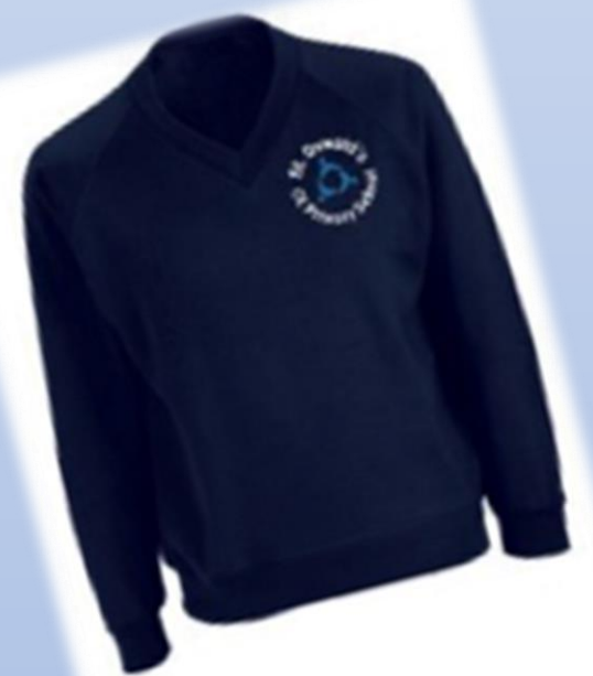
St Oswald's V-Neck £12.99 - £15.99